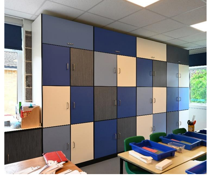
Year 4 rooms